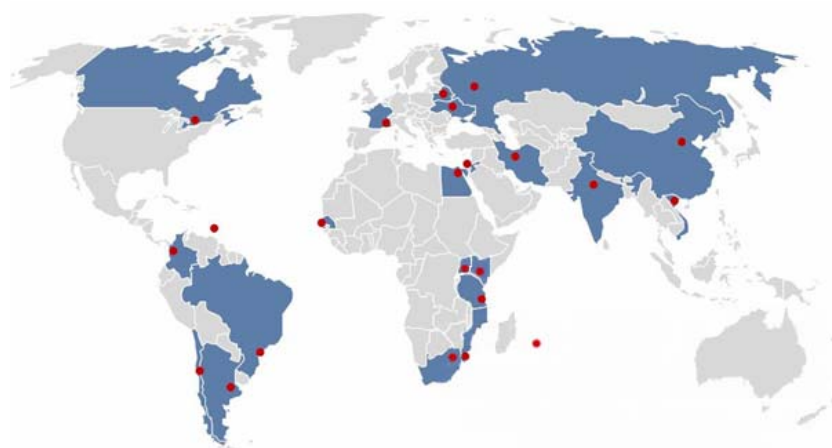
Map showing the global distribution of Vi member universities (23)