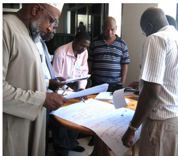
Working group on research methods at the trade and poverty workshop, Dar-Es-Salaam, Tanzania, November 2007

In addition to providing modular, generic training materials (see below) for use on undergraduate and graduate taught courses, the Vi has this year offered the opportunity to its member universities to adapt such material to their local needs. Eight member universities (Jordan, Argentina, Belarus, Colombia, Mauritius, India, Senegal) have so far been adapting existing Vi material on Investment, Commodities, Competitiveness and Trade Negotiations to their local needs, by for example, adding relevant case studies, data, exercises, or translating the material into their languages.