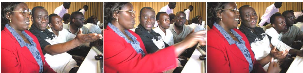
Participants at the Vi workshop on trade and poverty, Dar-Es-Salaam, Tanzania, 2007

In addition to individual resources for students, teachers and researchers, the Vi website also contains bespoke training material on several topics. This year, the Vi produced four major generic teaching materials, on the Transfer of Technology, Regional Trade Agreements, Trade and Poverty and Trade Data Analysis. All of the materials were conceived in consultation with network members and finalized with comments and additions from them; in this sense, the work of the Vi is very much 'owned' by the users of Vi materials and as far as possible responds to their specific needs. In recognition of the differences among the Vi membership in their connectivity and access to the internet, all of the Vi's training materials are also available on CD-ROM and in hard copy.